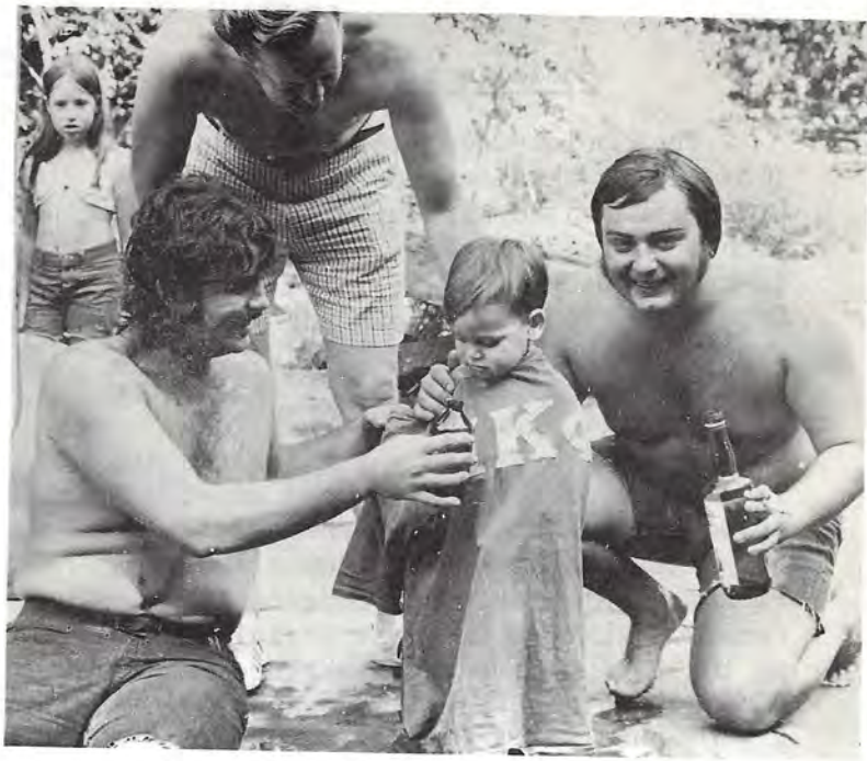
Positive proof that Pi Kappas come in all shapes and sizes.