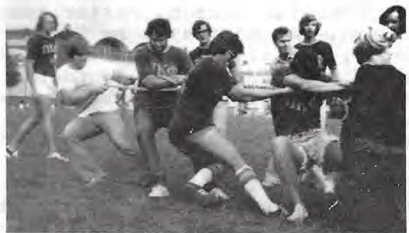
6 years goes to show, Pi Kapps can really pull