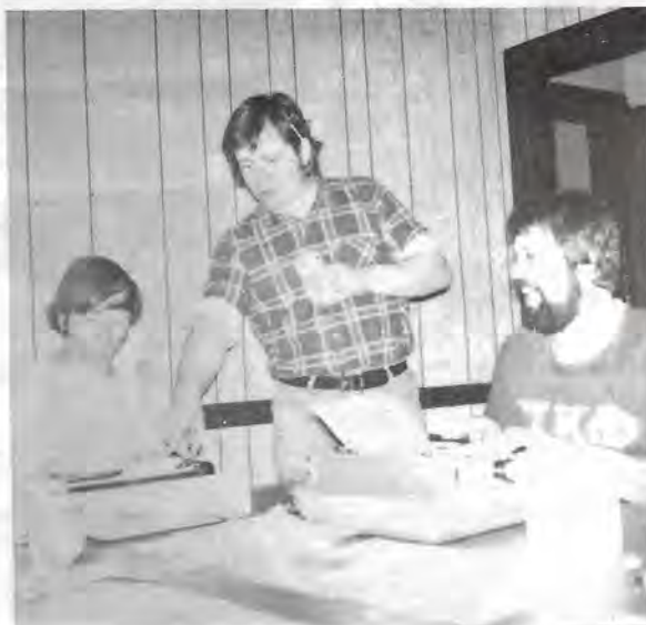
'The Staff Hard At Work'