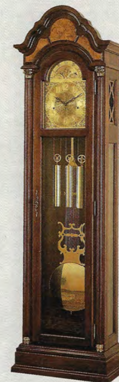
Plain pendulum clock shown above.

Complementing the finely detailed gold-tone rotating moon calendar is a gleaming brass-toned dial with raised brass numerals, polished gold-tone corner spandrels, and dramatic black serpentine hands. Each clock is further accented with three solid brass-encased weights and a brass lyre pendulum. The pendulum is delicately etched with the Coat of Arms of Pi Kappa Phi (optional plain pendulum also available).