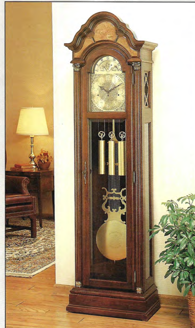
Etched pendulum clock illustrated above.

Please note that the monthly payment plan and the original issue price can be guaranteed to be available only to reservations postmarked or telephoned by April 15, 1985.