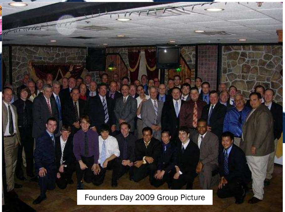
Founders Day 2009 Group Picture