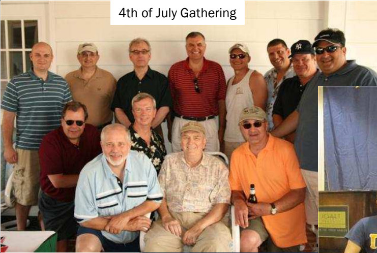
4th of July Gathering