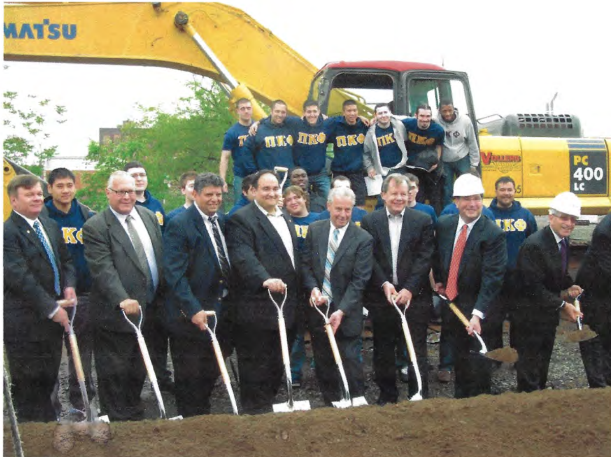
The Future of Beta Alpha